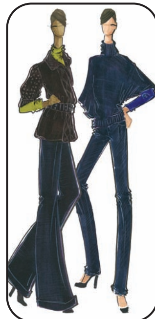
▲ Important sleeves are highlighted in the Bittersweet Pouf Sleeve Cardigan. The cool, Waisted Poncho tops the Blue Iris Turtleneck and slim denim.

This is uber American sensibility fused with inventive European shapes. Glamour reminiscent of Hollywood's Golden Age is balanced by fresh simplicity. Shapes reflect a feminine heritage yet allow contemporary versatility. There is textural interest in bouclés, jacquards, and chunky knits. The dense base colors of Midnight and Bittersweet provide firm foundation for the potent accents of Split Pea, Blue Iris, and Rubescent. Exotica fuses elegance with ease for the modern wardrobe.