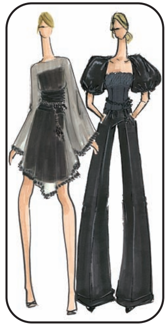
▲ Make an entrance... A Black Satin Strapless is double belted, then enhanced by the Black Chiffon Flutter Cape. The volume-sleeved Black Shrug tops the Jacquard Tulle Bustier for maximum impact.

▼ A perfect dress solution... The Pale Llama Reverse Jersey Dress. Sure chic... the jacket is Cheetah print on Llama Cord paired with a velvet pant.