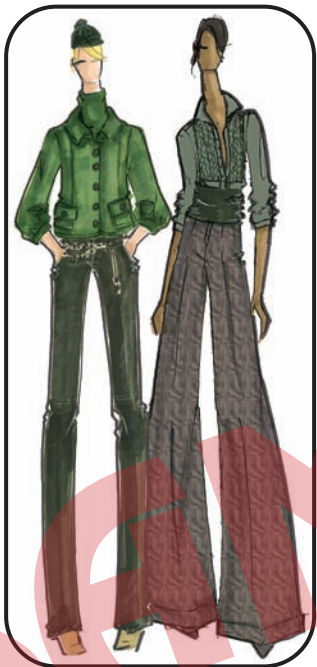
▲ Velvet in Gecko Green is fashioned into a jacket with interesting shape and sleeves. Bibbed Stripe Shirt looks smart with a plaid volume trouser.

▼ A perfect dress solution... The Pale Llama Reverse Jersey Dress. Sure chic... the jacket is Cheetah print on Llama Cord paired with a velvet pant.