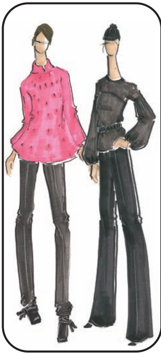
▲ The shape-driven Confetti Pullover swings over a slim pant. Another shape to covet... the Twilight Gray Antoinette Pullover.

Bauhaus meets wit and charm... these clothes are shape-driven and architectural with crisp, clean lines. This marks a return to minimalism that is fresh, functional, and aesthetic. Classic fabrications are merged with razor-sharp technology. Crisp neutrals are penetrated by luminescent color. Black and Twilight Gray are contrasted by Winter White, then punched by Confetti, a deep pink, and Bluestar, a gentle blue. Functional days evolve seamlessly into memorable evenings. Bubblicious is a delicious compilation of stylish and urbane chic.