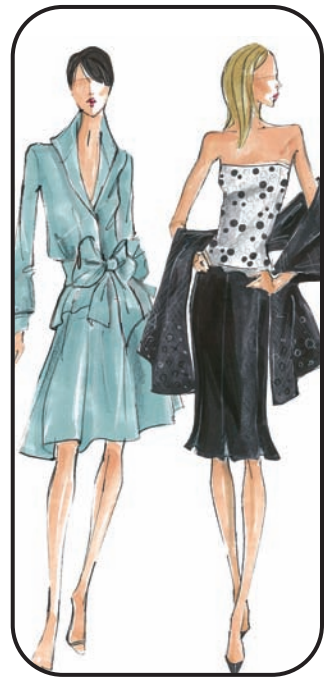
▲ Elegant Bluestar silk taffeta is bowed and flared for flattery. Dazzle for evening in the Tulle Bustier with Black Velvet.

▼ Beyond basic is the Flare Bomber Jacket over Fall's updated White Shirt. The Llama Plaid Fringe Shawl is worn as a skirt.