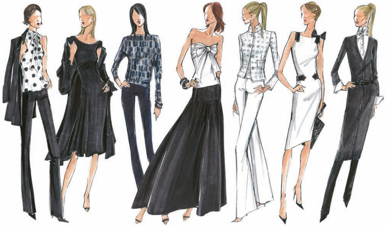
Presenting the Fall 2007 Worth Collection