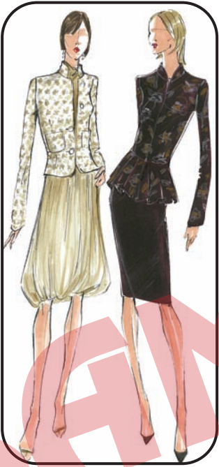
▲ Gold Dust Balloon Skirt enhances the elegant re-embroidered Lurex Jacket. Sophisticated glamour in the subtly metallic Jacquard Rose Jacket with Silk Trapunto Skirt.

▼ Swing shapes the Gecko Green Cashmere Poncho over the charming Fringed Plaid Skirt. Fall is personified in the Cashmere Jacquard Cardigan.