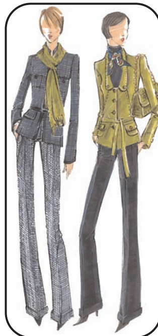
▲ Split Pea Cashmere pops the Midnight Tweed Jacket paired with Puppy Tooth. Split Pea in high style leather over a column of Midnight Cashmere and Gab.

This is uber American sensibility fused with inventive European silhouettes. Glamour reminiscent of Hollywood's Golden Age is balanced by clean simplicity. Shapes reflect a feminine heritage yet allow contemporary versatility. There is textural interest galore... chunky tweeds, corduroy, felted wool, and printed stretch georgette. The dense base colors of Midnight and Bittersweet provide firm foundation for the potent accents of Split Pea, Blue Iris, and Rubescent. Exotica fuses elegance with ease for the fashionable wardrobe.